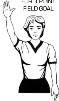
Official will raise one arm on attempt