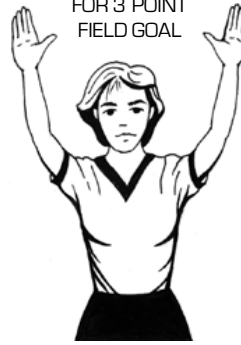
If field goal is successful raise both arms