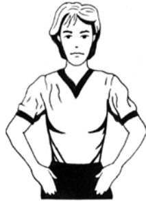
Hands on hips