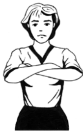
Arms outstretched and crossed in front of chest