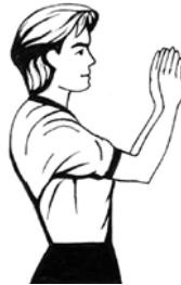
Signal foul: Imitate push