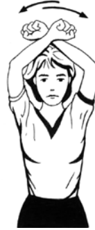
Crossed clenched fist above head