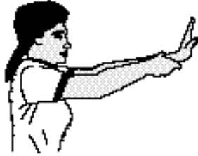
Arm straight out opposite arm grabbing wrist