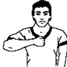
Arm bent 90 degrees in front of body