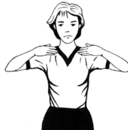
Touch shoulders with hands